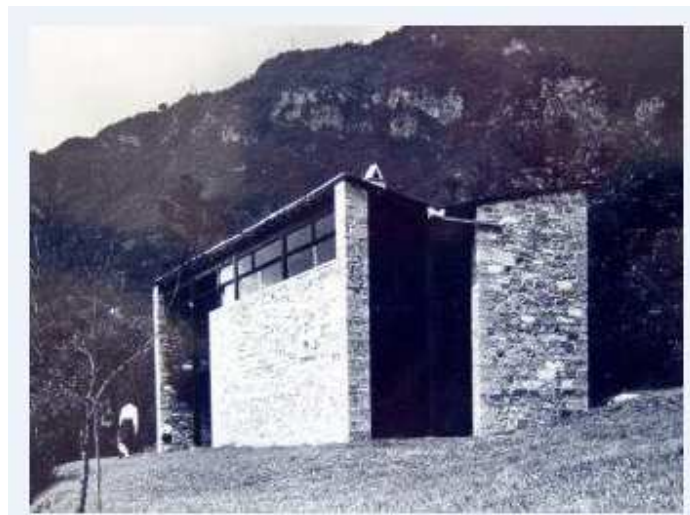
Pietro Lingeri, Casa per Artisti A, Isola Comacina, Ossuccio, Como, Italy