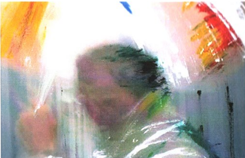
Photopainting on canvas, 50x70cm (detail)

The photo painting installation by Lisa Borgiani, presented at the Embassy of Italy in Washington, DC on the occasion of Remembrance Day 2014, is a series of colored images shot sequentially amidst 2711 grey slabs evoking the headstones of murdered Jews. The succession of each soft image symbolizes quick meetings and encounters between people pursuing their own paths in a moment that is timeless and in a place without an entrance or exit (sense of being lost), which evokes a disturbing sense of the Nazi regime's unyielding control through the rippling motion of an uneven pavement disrupting the solid structure. The disorienting effect through the camera lens is intended. The visitor is alone, facing the memory of the genocide in an ephemeral place.