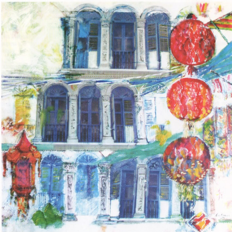
Facing China Town - Digital Print & Painting on canvas - 130 x 130 cm - 2007