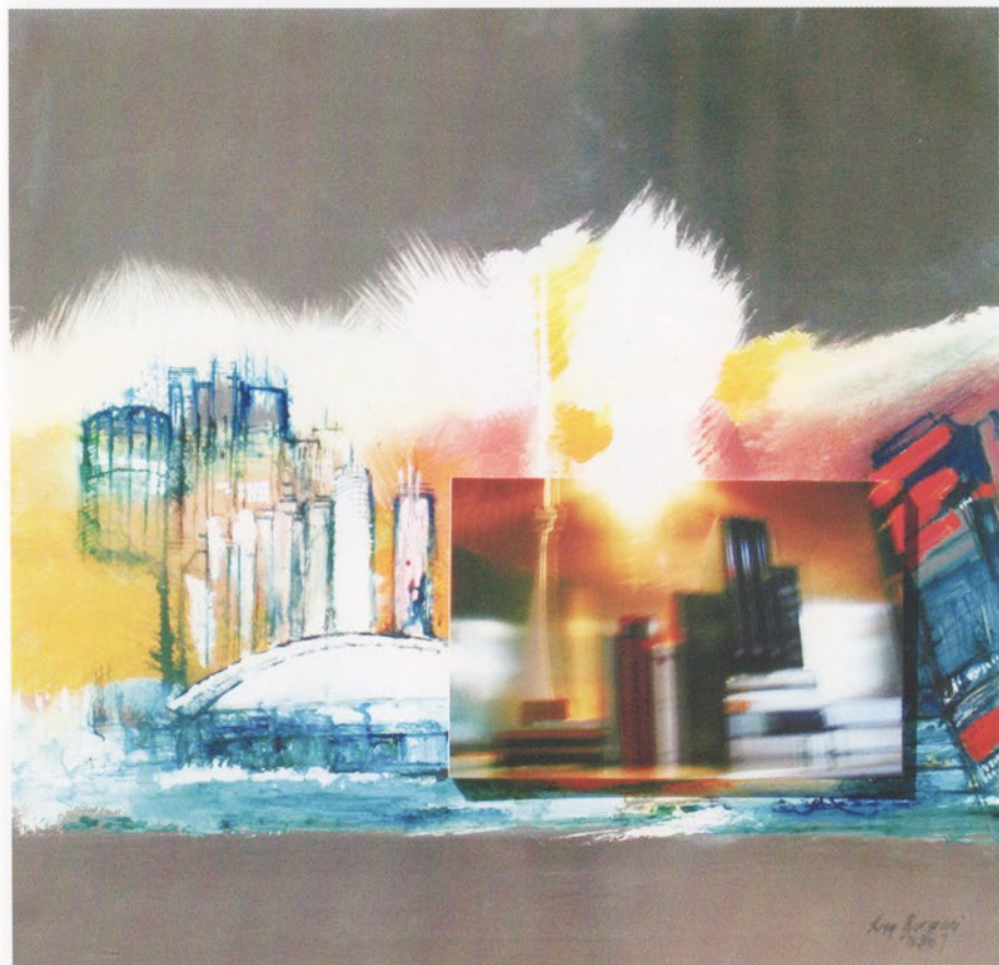
Radio Tower, Toronto - Photo and Painting on board - 100 x 100 cm - 2007