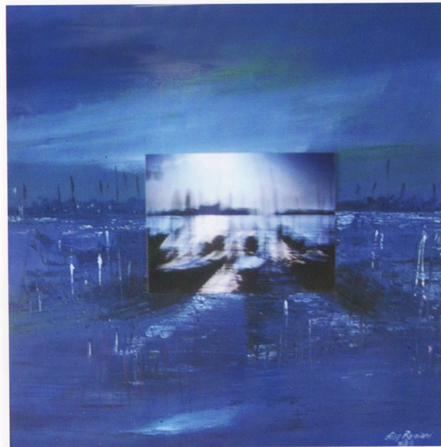
On The Waves - Photo and Painting on board - 100 x 100 cm - 2007