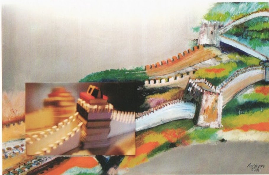
The Great Wall, China - Photo and Painting on Steel Sheet - 140 x 100 cm - 2007