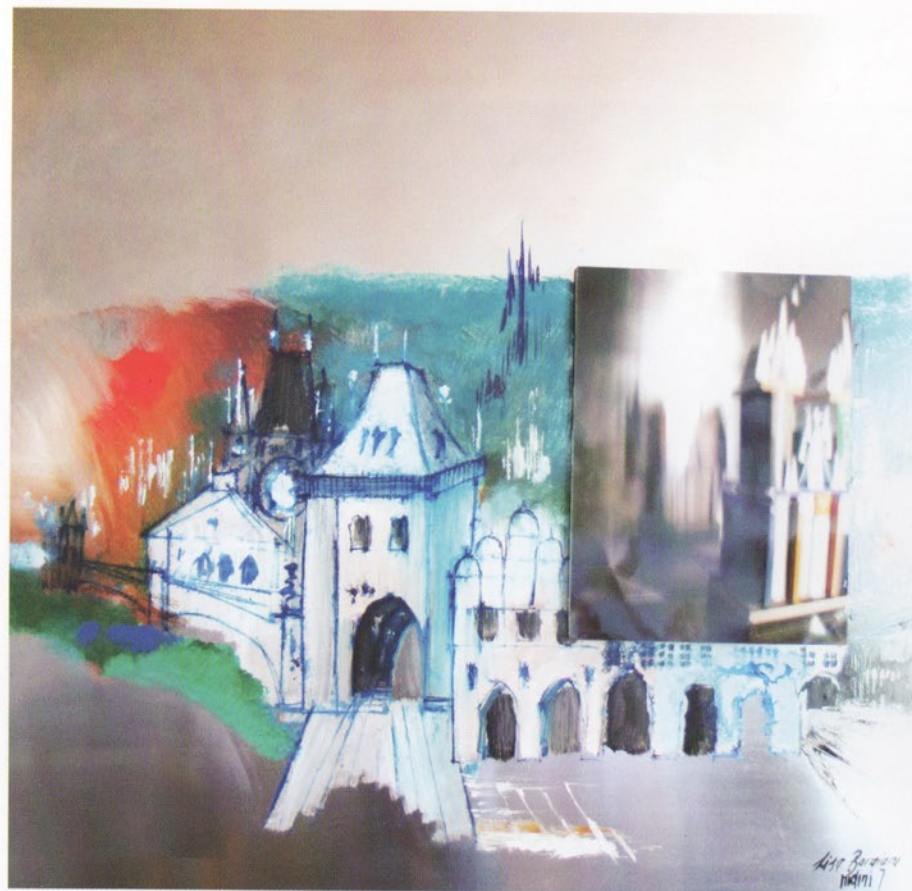
Tyn Church, Prague - Photo and Painting on Steel Sheet - 100 x 100 cm - 2007