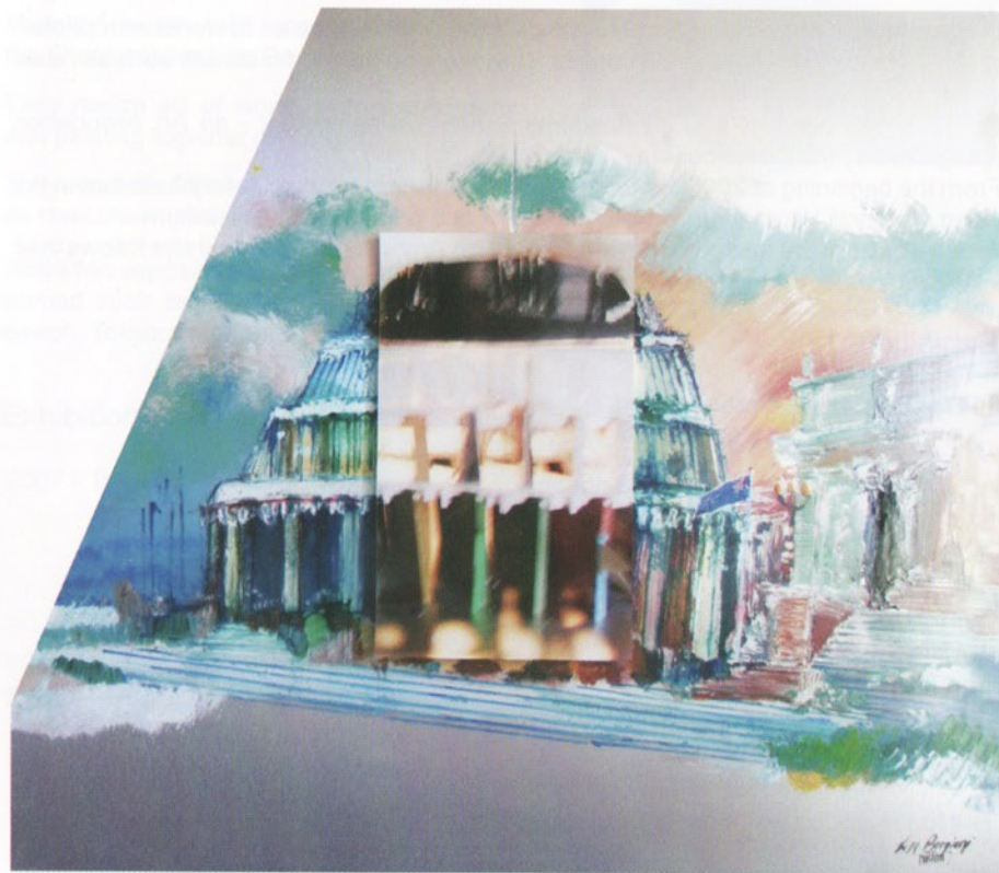
Beehive, Wellington - Photo & Painting on Steel Sheet - 120 x 110 cm - 2007