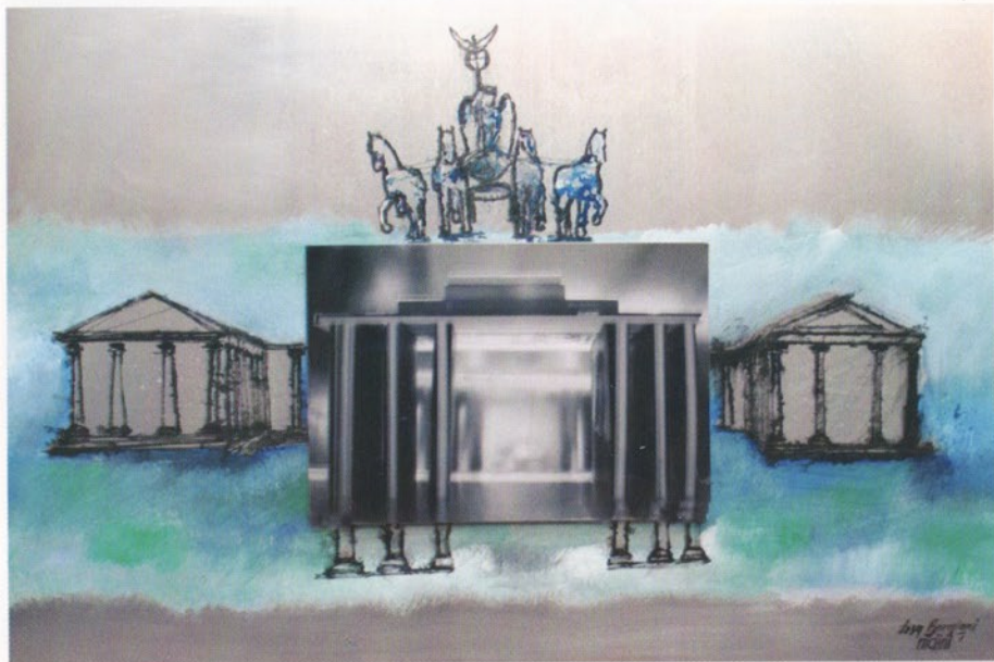
Brandenburg Gate, Berlin - Photo and Painting on Steel Sheet - 100 x 70 cm - 2007