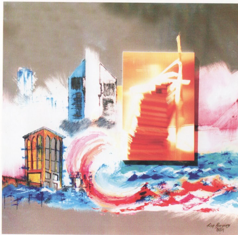
Burj Al Arab, Dubai - Photo and Painting on board - 100 x 100 cm - 2007