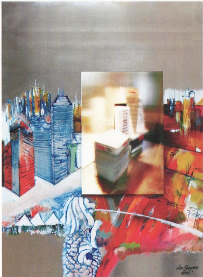
The Merlion, Singapore - 100 x 140 cm - Photo & Painting on Steel Sheet - 2007