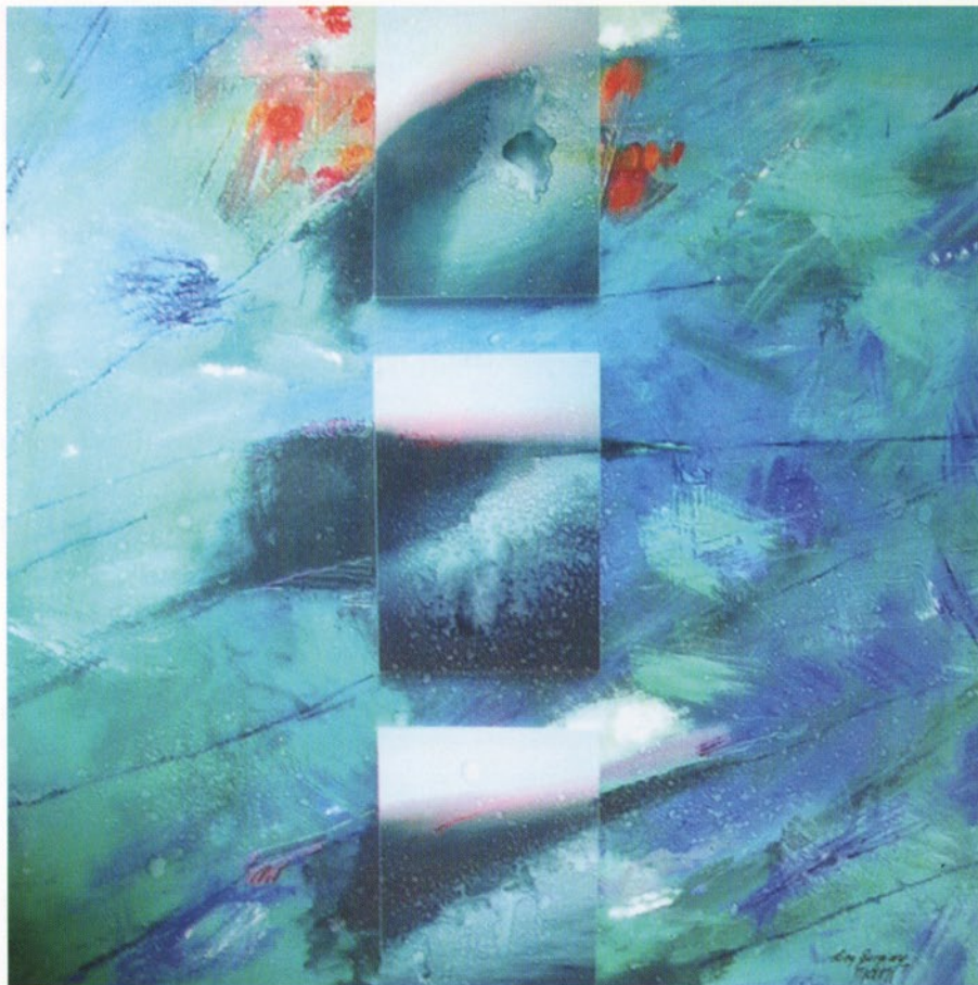
Breeze - Digital Print and Painting on canvas - 100 x 100 cm - 2007