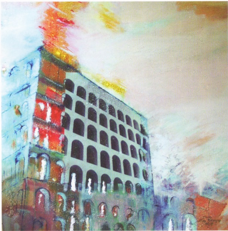
Rome - Digital Print and Painting on canvas - 100 x 100 cm - 2007