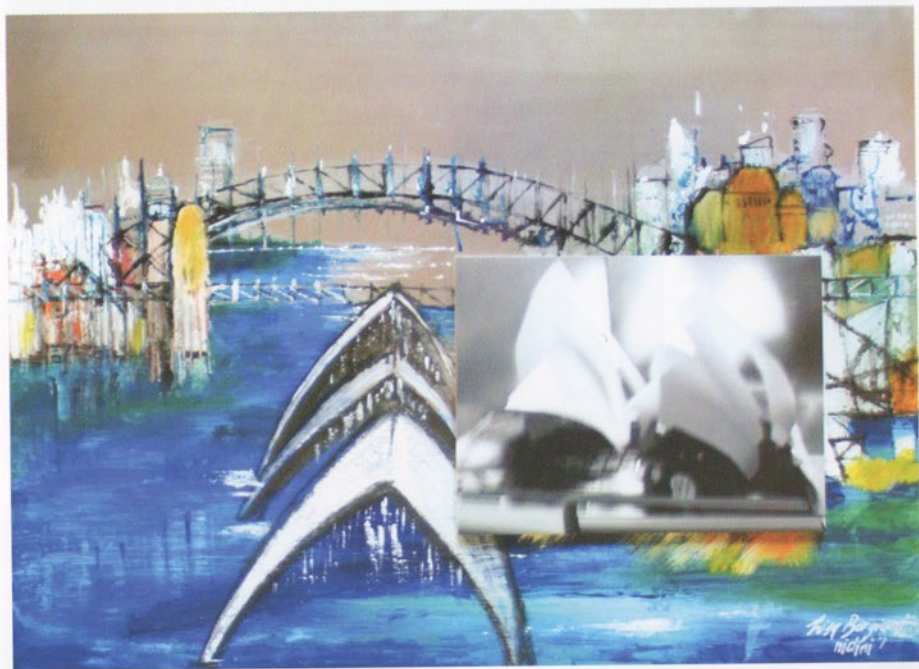
The Opera House, Sydney - Photo and Painting on Steel Sheet - 100 x 70 cm - 2007