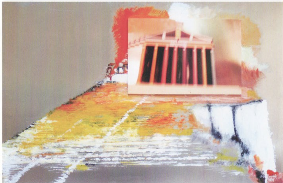
Partenone, Greece - Photo and Painting on Steel Sheet - 140 x 100 cm - 2007