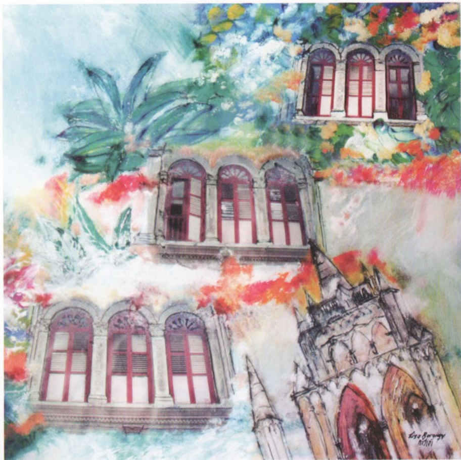
St. Andrews Cathedral, Singapore - Digital Print and Painting on canvas - 130 x 130 cm - 2007